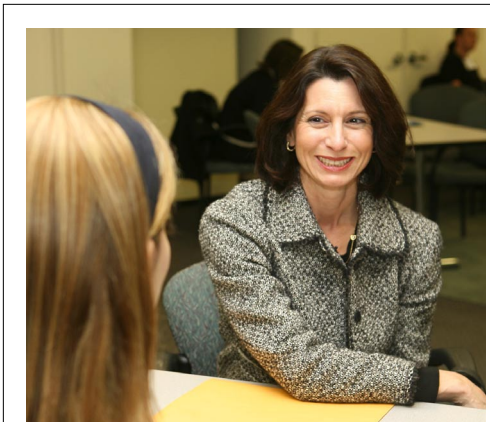
Knowing the right questions to ask and responses to give at an interview is one of the topics discussed at the Career Transition sessions.

In addition to F·E·G·S's regional employment and career services, the UJA-Federation Connect to Care initiative provides mental health counseling, financial and legal assistance, and emergency cash assistance. F·E·G·S's ParnossahWorks™, an online employment and job board system, provides the infrastructure to effectively coordinate the range of employment and career resources for both job seekers and employers.